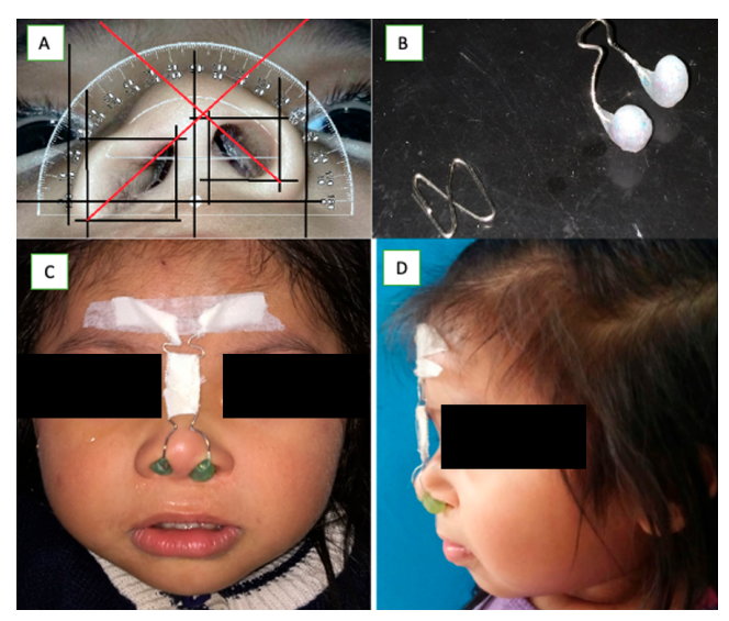
Figure 2. A: Digital marking. B: alveolar molder and frontal traction attachment. C and D: alveolar molder in position and function during frontal traction.

Nll-Midline Distance of the left nasal fossa to the midline