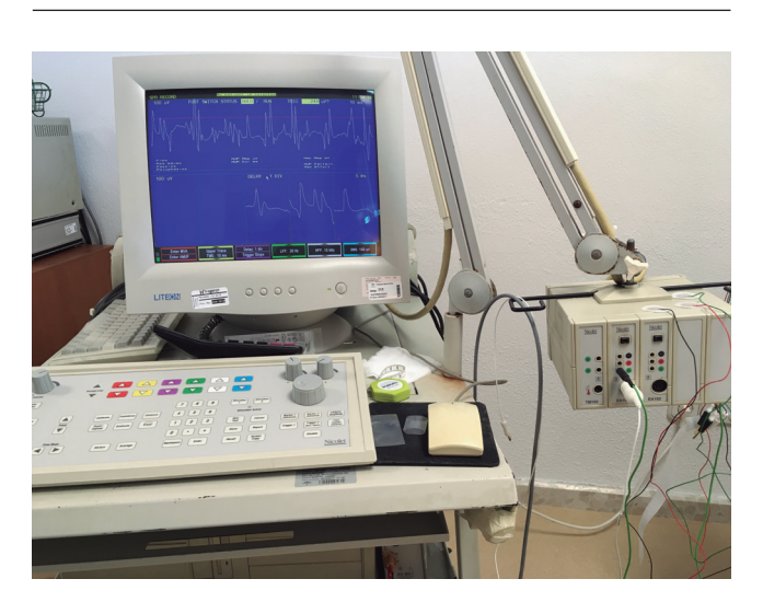
Figure 2. Electromyography equipment and Motor Unit Potential of lateral pterygoid. Biphasic and triphasic morphology waveforms after voluntary muscular contraction can be seen.

77 % of cases had subjective clinical improvement with pain reduction with the first injection. According to the CS, a homogeneous response distribution to treatment was observed (Table I). The mean duration of the toxin effect was 3.7 months. The mean decrease post-infiltration of pain evaluation in the NS was 4.9 \pm 2.9 points. Before treatment, no patient had a pain below 6 in the Numerical Scale, being greater than or equal