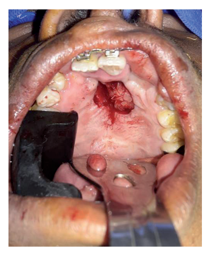
Figure 2. Peripheral incision in the edges of the fistula.

corroborate the defect, the use of PRAAT software for appreciation of hypernasal resonance, Lingual motility, deep and superficial sensitivity and the sense of taste of each patient are evaluated. The maxillofacial clinical examination shows patients with defects from 9mm wide x 14mm long approximately, in the anterior part of the hard palate, with diffuse borders, normochromic mucosa and hydrated in said region (Figure 1). Cone Beam tomography showed an isodense im-