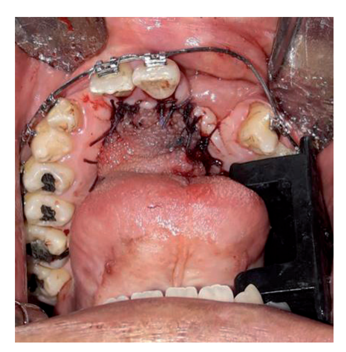
Figure 4. Closure at the periphery of the fistula and the flap of the tongue to the nasal layer and the mucosa of the palate.

a 4.0 resorbable suture and later a 3.0 resorbable suture was used, using simple points to fix the flap of the tongue to the nasal layer and the mucosa of the palate by mouth (Figure 4).