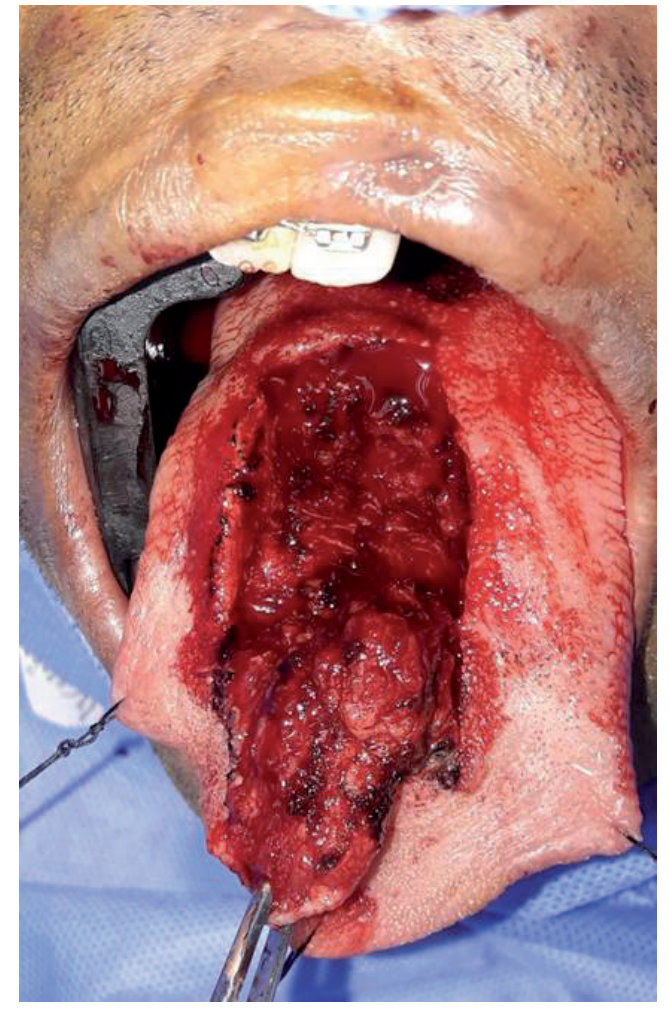
Figure 3. Flap of the tongue.

corroborate the defect, the use of PRAAT software for appreciation of hypernasal resonance, Lingual motility, deep and superficial sensitivity and the sense of taste of each patient are evaluated. The maxillofacial clinical examination shows patients with defects from 9mm wide x 14mm long approximately, in the anterior part of the hard palate, with diffuse borders, normochromic mucosa and hydrated in said region (Figure 1). Cone Beam tomography showed an isodense im-