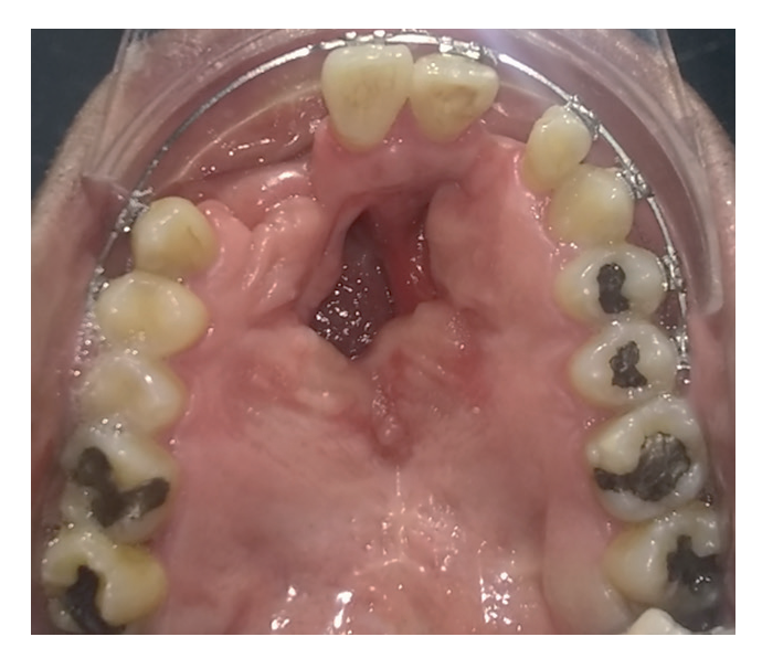
Figure 1. Palate fistula.