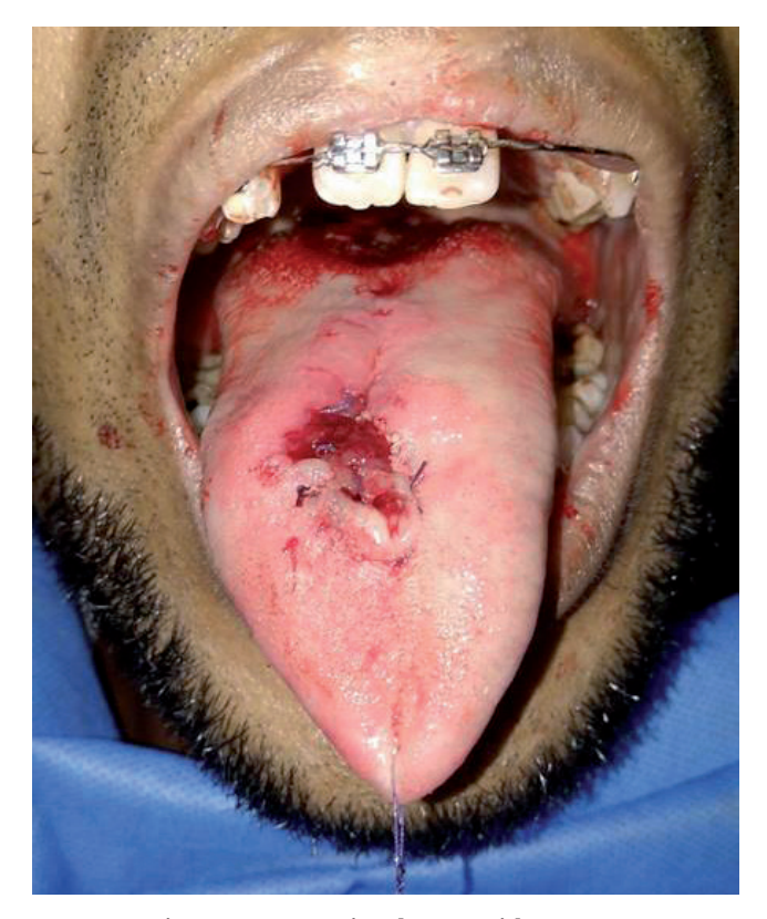
Figure 5. Donor site closure with suture.

The donor site of the tongue was closed with 3.0 resorbable suture with mattress points after a meticulous hemostasis (Figure 5).