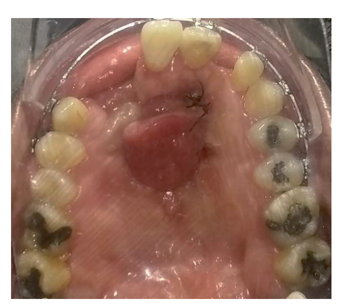
Figure 6. Late postoperative.

Pain intensity was evaluated by the visual analog scale (VAS) that analyzes pain from 0 to 10 points where values from 1 to 3 indicate soft to moderate pain, from 4 to 6 moderate to severe pain, and more than 6 very intense, resulting in an average of 3.3 in this study, being in the range of pain from mild to moderate, with a standard deviation of 1.42, grouping the