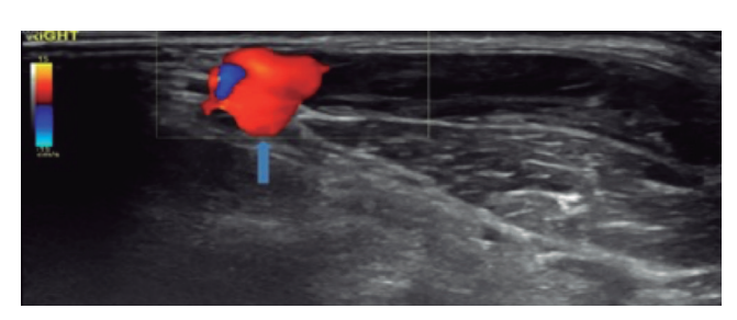
Figure 1. Ultrasound image of right laterocervical region. Hypoechoic mass of 3 cm in diameter, superficial to sternocleidomastoid muscle and in relation with EJV can be appreciated without Doppler signal, while EJV has positive signal (arrow).

79-year-old patient with medical history of arterial hypertension treated with con Eprosartan and Parkinson's disease treated with Levodopa and Benserazide. Consults for a 4 month-long mass of about 3 cm, without size variation with Valsalva maneuver, soft consistency, non-pulsatile and without deep structure fixation, in the anterior neck triangle. Refers mild intensity and chronic somatic pain. No palpable lymphadenopaties or tumours are identified. Contralateral physical examination is normal. No history of trauma nor of central vein catheterization. Doppler ultrasonography which identifies a 31 x 5 x 44 mm lesion, ovoid, well defined above all hypoechoic (Figure 1) and a Computed Tomography (CT) of supra-aortic trunks is done (Figure 2). After agreeing on a conservative attitude, anticoagulation therapy with Acenocumarol is started. After 3 months, the patient refers new pain episodes and a supra-aortic trunk