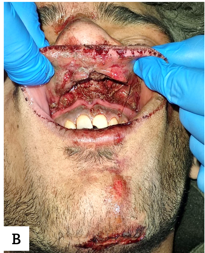
Figure 1. A: patient with a motorcycle RTA presenting with a crushed upper lip, a laceration to the forehead, and a laceration to the left lateral eye, as well as a nasal fracture. B: an open lacerated wound in the upper vestibule filled with dust and tar.