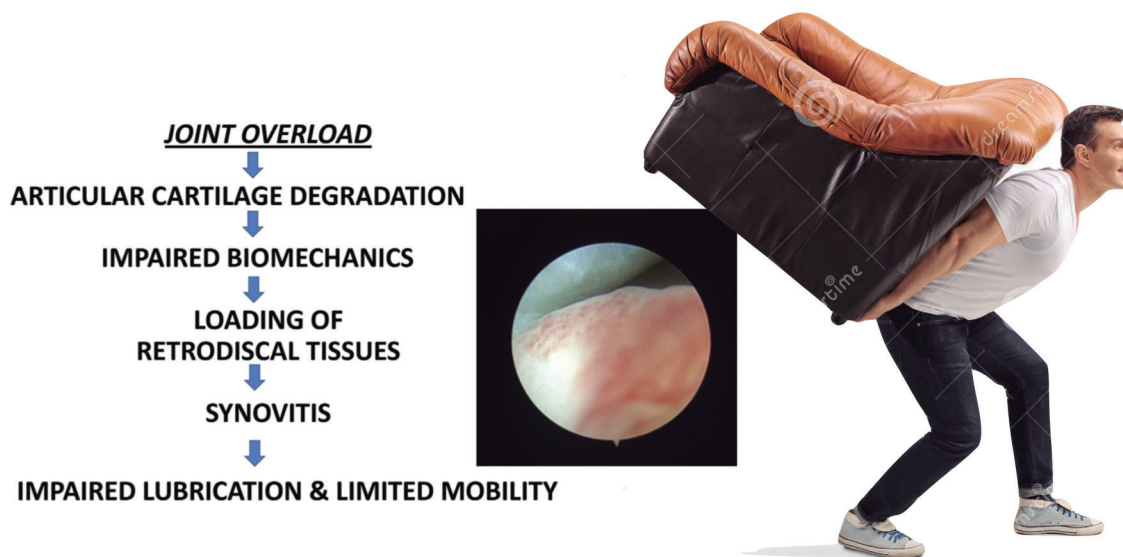
Figure 1. Proposed pathway for development of internal derangement of the temporomandibular joint (TMJ).

Israel 1 has recently defined internal derangement (ID) as a condition in which there are damaged intra-articular tissues leading to disturbances in the biomechanical functioning of the TMJ (Figure 1). Based on this broader definition, anterior disc displacement is considered one type of internal derangement without exclusivity. Thus, a patient who has severe limited mouth opening with decreased translation of the TMJ caused by adhesions, osteoarthritis, synovial inflammation, disc displacement, or other intra-articular disorder is considered to have the clinical signs and symptoms of ID. Besides, condylar hyperplasia (CH) is a non-neoplastic pathology resulting from the excessive growth of the condylar head and neck. It can