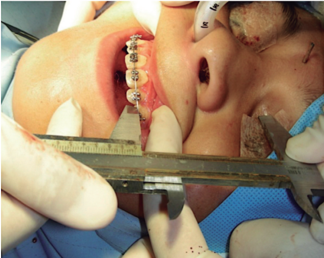
Figure 2. Intraoperative measurement using the medial canthus as an external reference point.

At the beginning of the procedure the starting point measurement was recorded and before fixing the maxilla in its new position new measurements were obtained to ensure that the planned vertical change of the maxilla (PVC) is met, avoiding a maxillary cant or an unplanned malposition with consequences on the aesthetic result. Both measurements were made during maxillary repositioning and were rechecked after internal rigid fixation, all measurements were made by the same operator (M.B).