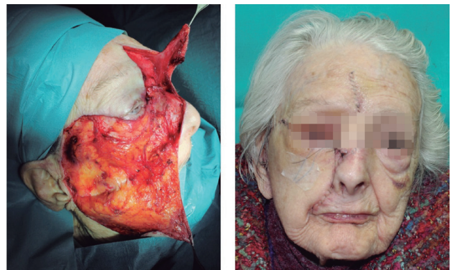
Figure 2. Harvesting of an inverse facial advancement for the cheek and the lower eyelid and a glabellar flap for the nose (left). Results after 1 week (right).

tional results, as the patient preserved a good eyelid competence despite the small right eyelid retraction. No adjuvant therapy was considered. No revision surgery was needed.