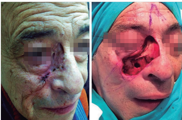
Figure 3. Recurrence of a basal cell skin cancer previously irradiated, affecting both medial cheek and nasal sidewall (left). Defect after removal of the skin tumour and the anterior wall of the maxillary sinus (right).

In our experience, the use of separate flaps to reconstruct these composite facial defects allowed to obtain very pleasant like with like results.