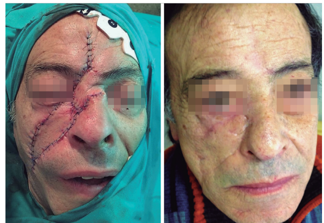
Figure 4. Reconstruction with a glabellar flap and a V-Y advancement flap (left). Results after 6 months of follow up (right).