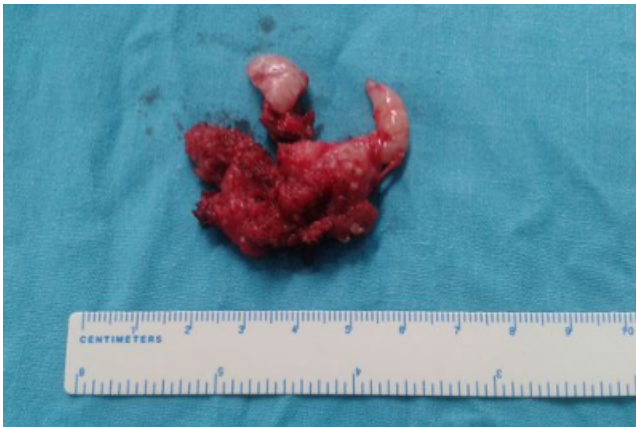
Figure 2. Surgical specimen of an ameloblastic fibroma showing a solid mass with areas of smooth surface. Grossly, ameloblastic fibroma appears as firm, lobular soft tissue mass with a smooth surface.

onstrated a well-circumscribed heterogenous cystic lesion showing areas of density similar to liquid and others similar to soft tissue. These lesions showed an expansive behavior with cortical thinning and calcifications, with teeth inclusion.