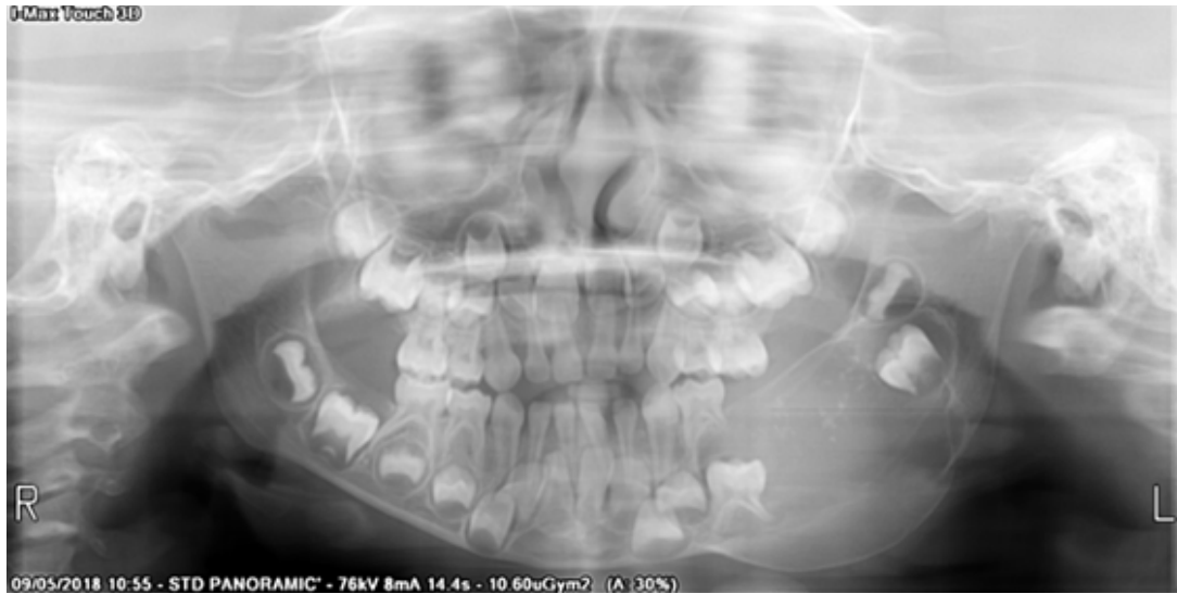
Figure 1. Ameloblastic fibroma in the left mandibular body and angle. A cystic lesion with impacted teeth (75) and cortical expansion is seen.