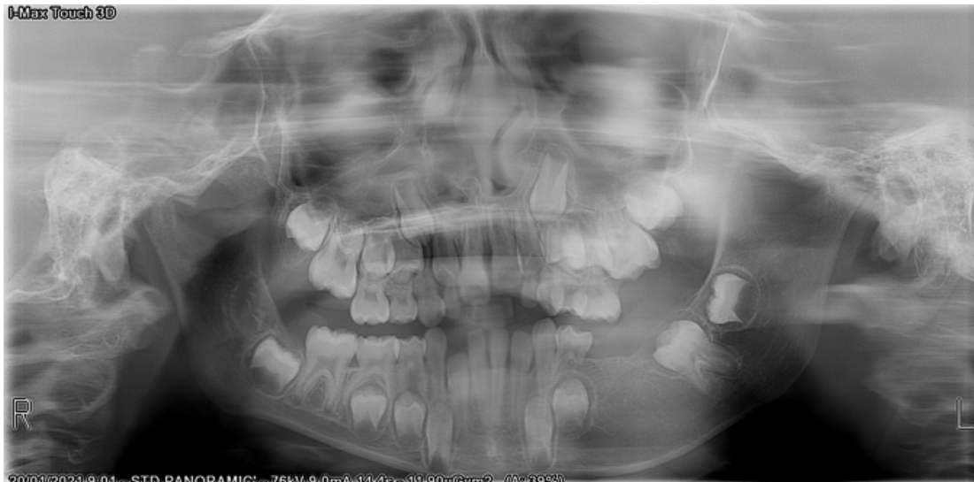
Figure 4. The same patient as in Figure 1, 28 months after surgery. Satisfactory bone filling is observed.

Patients underwent orthodontic treatment without incident and facial symmetry was satisfactorily restored. None of the patients required further surgery.