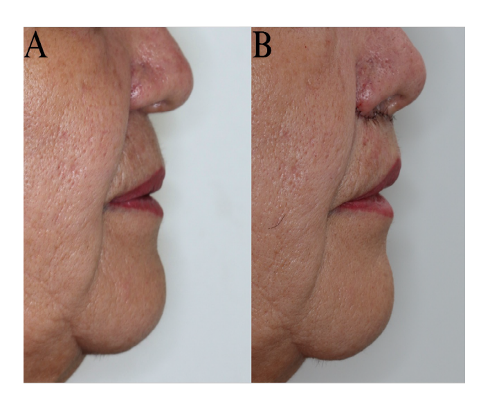
Figure 5. Photographs in lateral view. A: pre-operative. B: 7 days post-operative.