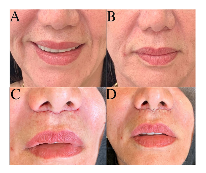
Figure 1. A: frontal photograph of the patient smiling. B: and with relaxed lips. C: intraoperative photography after subcutaneous tissue closure. D: final appearance of the sutures, showing tooth exposure with relaxed lips.

The treatment plan consisted of performing a lip lift surgery with the excision of 6 mm of tissue (Figure 1C and 1D). After 7 days, the sutures were still in place, showing no signs of infection, with a favorable scar appearance (Figure 2A and 2B). At the 20-day postoperative mark, the patient exhibited exposure of three knots of 5.0 polyglactin thread, which had been used for subcutaneous tissue closure, and its removal was necessary (Figure 2C). After 30 days, the patient maintained a good scar appearance, without signs of infection, and no additional interventions were required. After 12 months, the patient remains satisfied with a favorable aesthetic outcome, showing dental exposure of 2.5 mm at rest and 6 mm while smiling, with a balanced proportion between the upper and lower lips, and the upper vermilion measuring 9 mm in height (Figure 3).