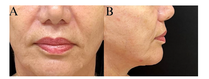
Figure 3. 12-month post-operative photographs. A: frontal view. B: side view.