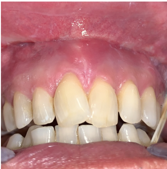
Figure 4. Upper lip metaplasia observed after one month of postoperative period.