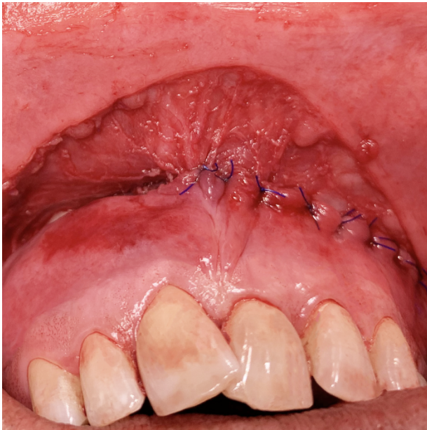
Figure 1. Clinical case of upper lip wound closure with the new technique in a OSA patient. Intraoperative wound closure by suturing the lower edge to the buccal space allowing mucosal metaplasia and vermillion elongation.