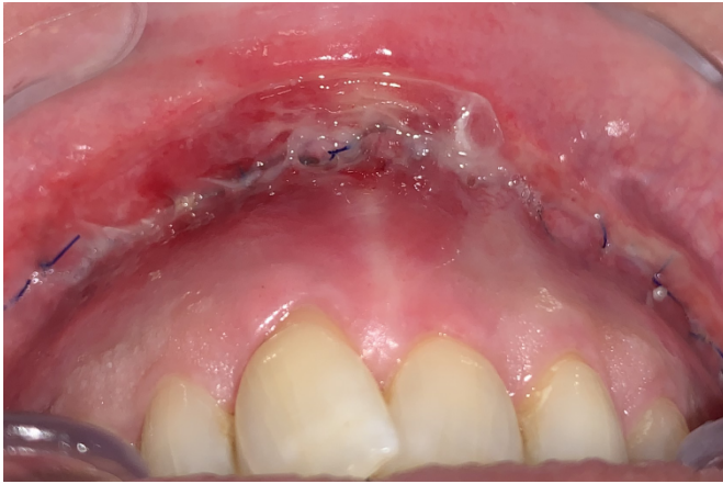
Figure 3. Clinical case of upper lip closure technique. Mucosal metaplasia of the lip mucosa after one-week of postoperative period. Upper lip vermilion elongation can be observed due to this suture.