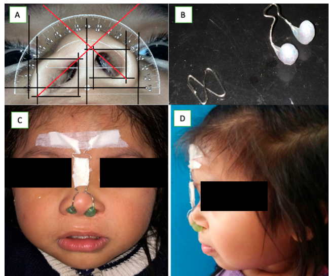
Figure 2. A: Digital marking. B: alveolar molder and frontal traction attachment. C and D: alveolar molder in position and function during frontal traction.