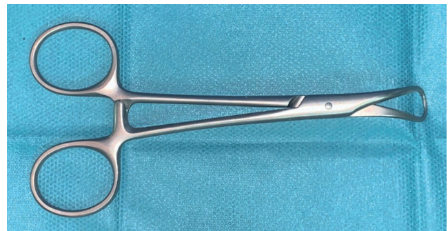
Figure 1. Towel clip used to perforate the bone.

The success rate reported for the alveolar bone graft is 84-91 % among different authors 5 and has been associated to the eruption status of the canine at the cleft, being greatly improved when the surgery is performed before the dental