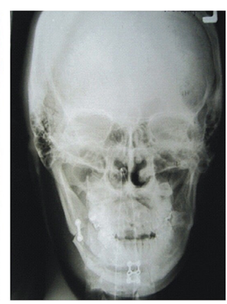
Figure 8. The image displays a PA Cephalogram depicting the radiographic changes that occurred before and after orthomorphic surgery.

Postoperative mouth opening reduction was due to discomfort and edema, resolving at 3 months. The assessment of postoperative symmetry was deemed satisfactory in three cases, indicating good symmetry, while in one case the assessment showed a moderate level of symmetry (Figure 8). The results were similar to the authors' previous results with this technique i.e., 60 % of cases showed good mandibular symmetry while 40 % showed moderate symmetry<sup>5</sup>. No postoperative complications were observed, but the follow-up period was deemed insufficient to assess graft resorption (Table I). The technique's limitations include imperfect symmetry and deficient mandibular body in some patients. The preoperative and postoperative remained unaltered as orthomorphic correction focuses on correcting the shape and contour-related deformities without impacting the occlusal status<sup>1</sup>.