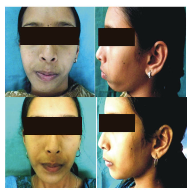
Figure 6. Preoperative and postoperative images (Case 4).

Written consent was obtained from the patients for undergoing the aforementioned procedure and for the publication of the case report and the accompanying images.