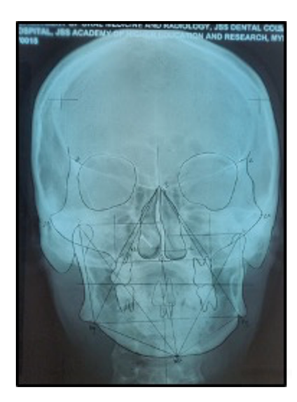
Figure 5. Preoperative Grummon's analysis (Case 3) showing a deficiency of 8mm on the right side.