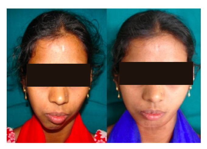
Figure 2. Preoperative and postoperative images (Case 2).