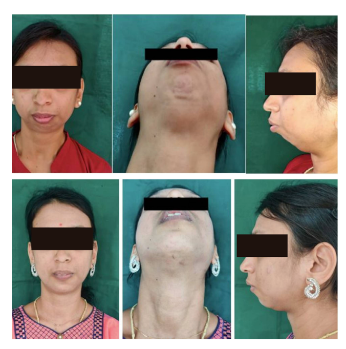
Figure 4. Preoperative and postoperative images (Case 3).

Case 4: A 16-year-old female presented to us with a complaint of left-sided facial disfigurement. She gave a history of undergoing resection of right TMJ ankylotic mass followed by interposition arthroplasty using temporalis muscle two years back. On examination patient presented with a convex facial profile, asymmetry of the mandible, and incompetent lips (Figure 6).